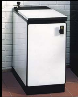
Grillon 15, 22 and 29 from 39,000 to 77,000 BTU/hr

In addition to their popular solid fuel cookers, Franco Belges offer a range of boilers and wood burning stoves. The boilers include the new look La Grillon, a sturdy, versatile and attractive central heating boiler, in three different models and with a new streamlined fascia.